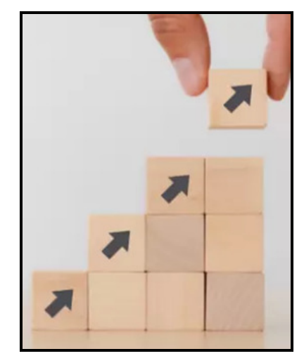
Fig-1: Small steps method [12]

*Encourage peer assisted learning, strategic blended learning and flipped learning methods: These are time tested methods and if used selectively, give wonderful learning success and is easy to implement and at the pace of learners – it can be used in small groups (Usually 10 students) and large group (Usually 25 students)