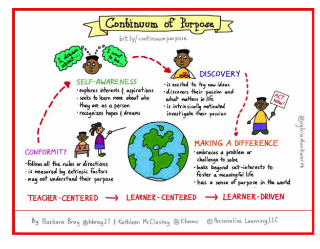
Fig-2: Learner Driven education [14]

There are large numbers of teaching and learning methods and different methods can be use for specific learning needs for learner and topics and